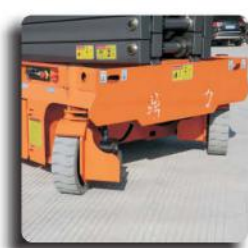
Compact Turning Radius