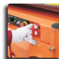
Emergency Lowering System