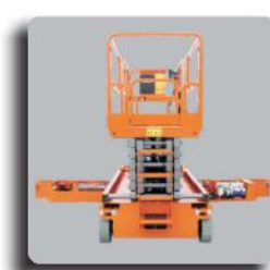
Swing Out Tray